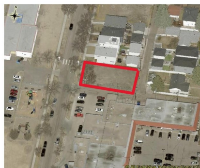
9115 143 St-Location