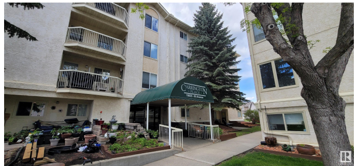
Carrington Place Building C

SUITE TYPE 2 D + DEN 1388 sq ft (1329 sq ft) FLOOR AREAS SHOWN MAY VARY FROM ACTUAL CONSTRUCTED UNITS.